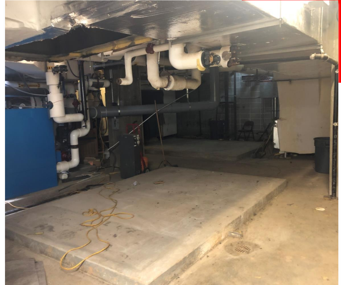
Performance Gym Mechanical Room#2 HVAC Demo Progress