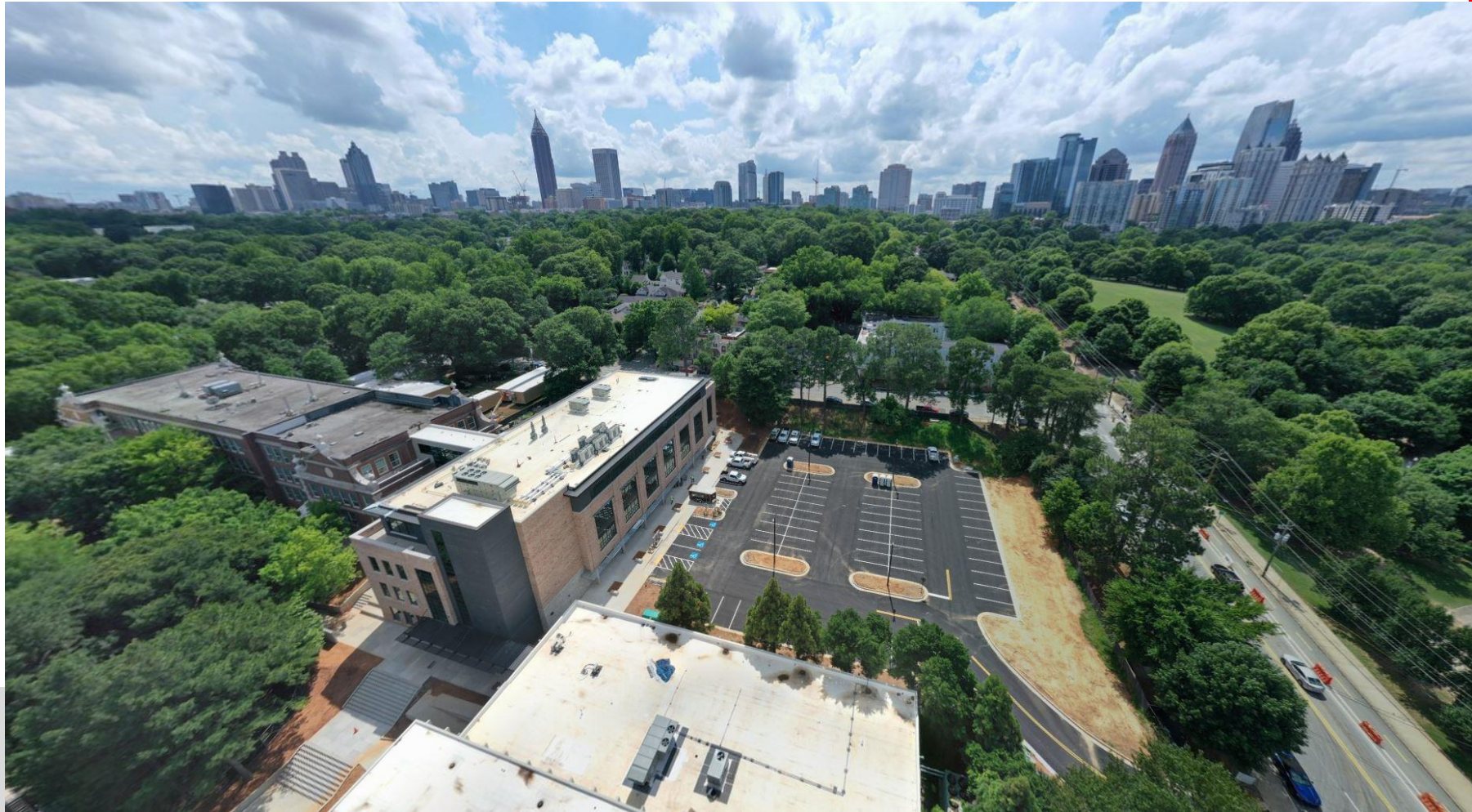
New Classroom Addition Building East Elevation