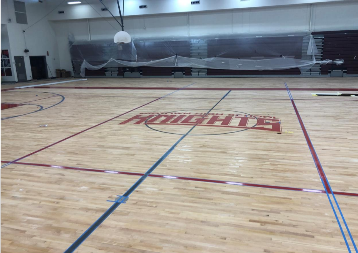
Performance Gym Court Refinishing with Midtown Knights Logo