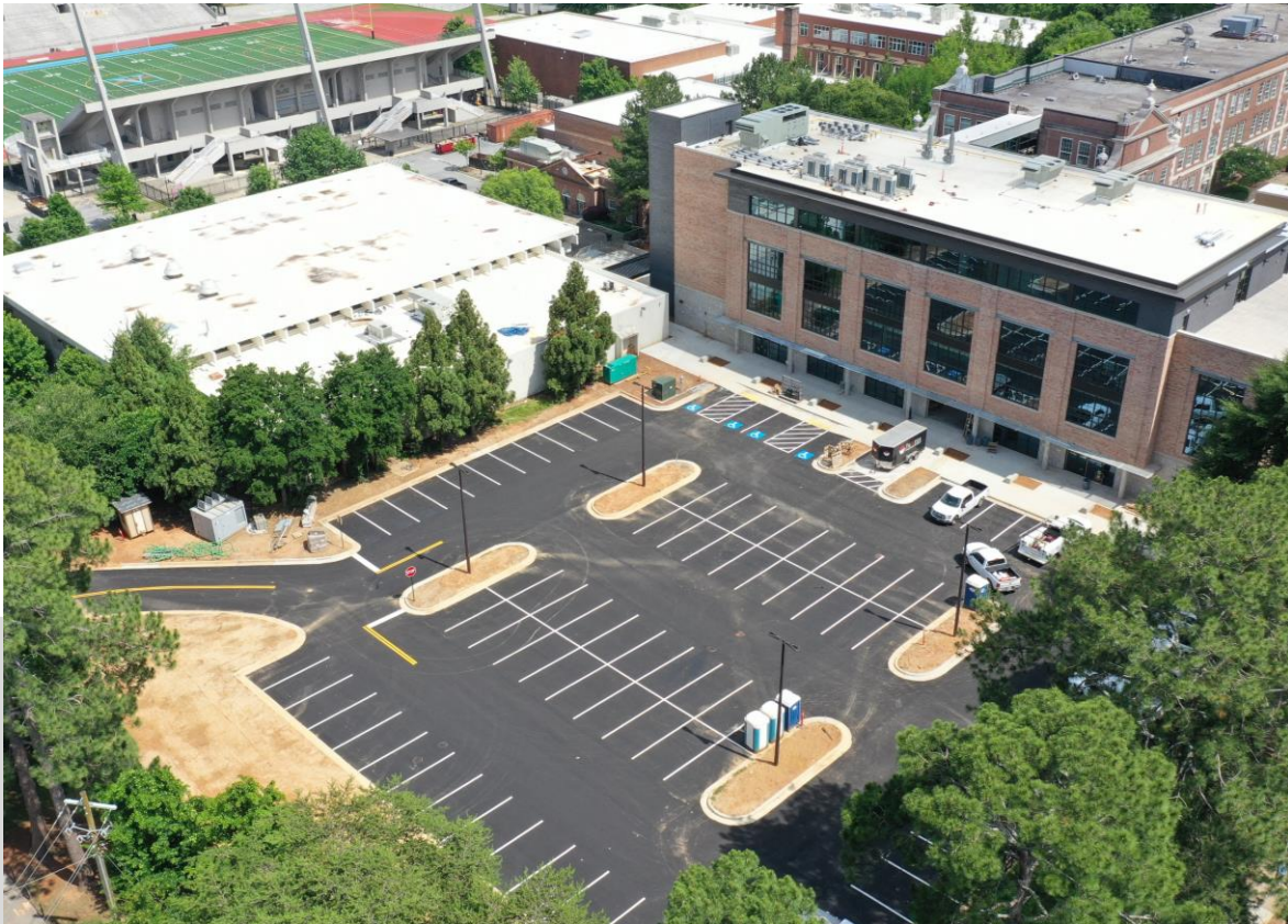
New Addition Building Northwest Elevation