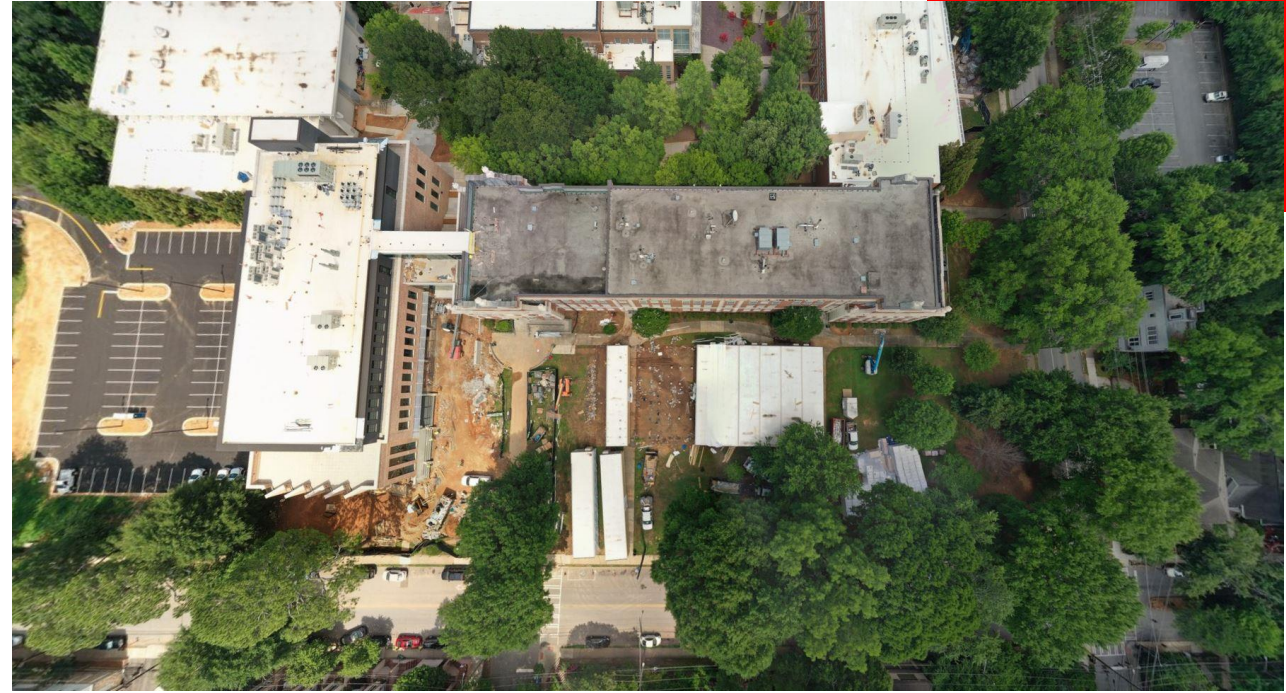
Charles Allen Building – New Classroom Addition Building Overview